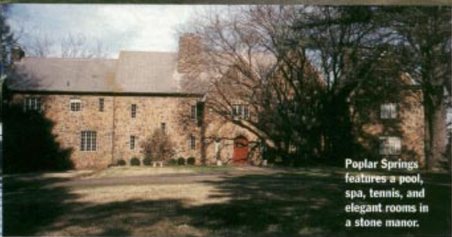
W E E K E N D S Poplar Springs features a pool, spa, tennis, and elegant rooms in a stone manor.

400-ROOM LUXURY RESORT IS MAKING its debut on Maryland's Eastern Shore just in time for fall. It's one of several additions to the region's growing choice of getaways.